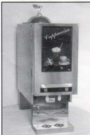
w/stainless steel door