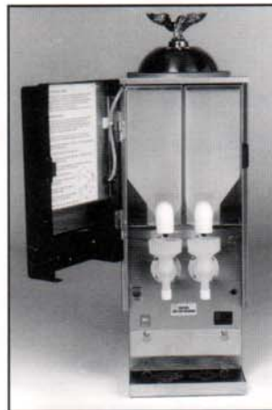
Model 454 II