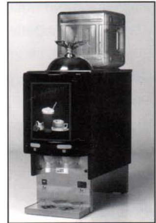
w/bottled water 3 Gallon Kit #6543