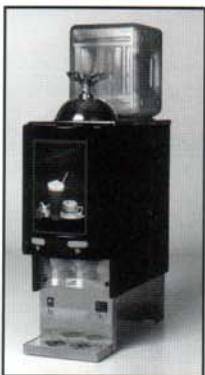
STANDARD MACHINE WITH WATER BOTTLE SHOWN. 3 GALLON KIT #6543