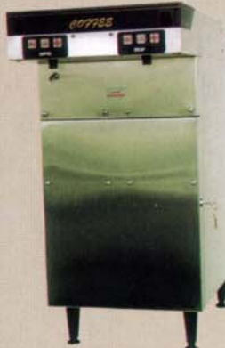
Model 670 Shown Alone