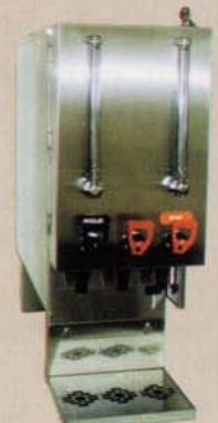
Model 672 Shown with Site Glasses