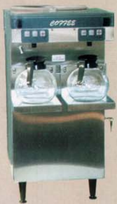
Model 670 Shown with Decanter