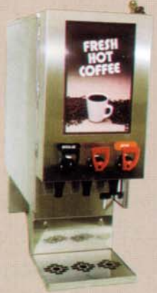
Model 672 Shown Alone