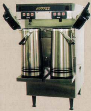
Model 670 Shown with Air Pot