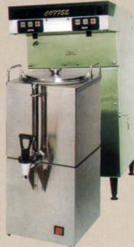
Model 670 Shown with Satellite